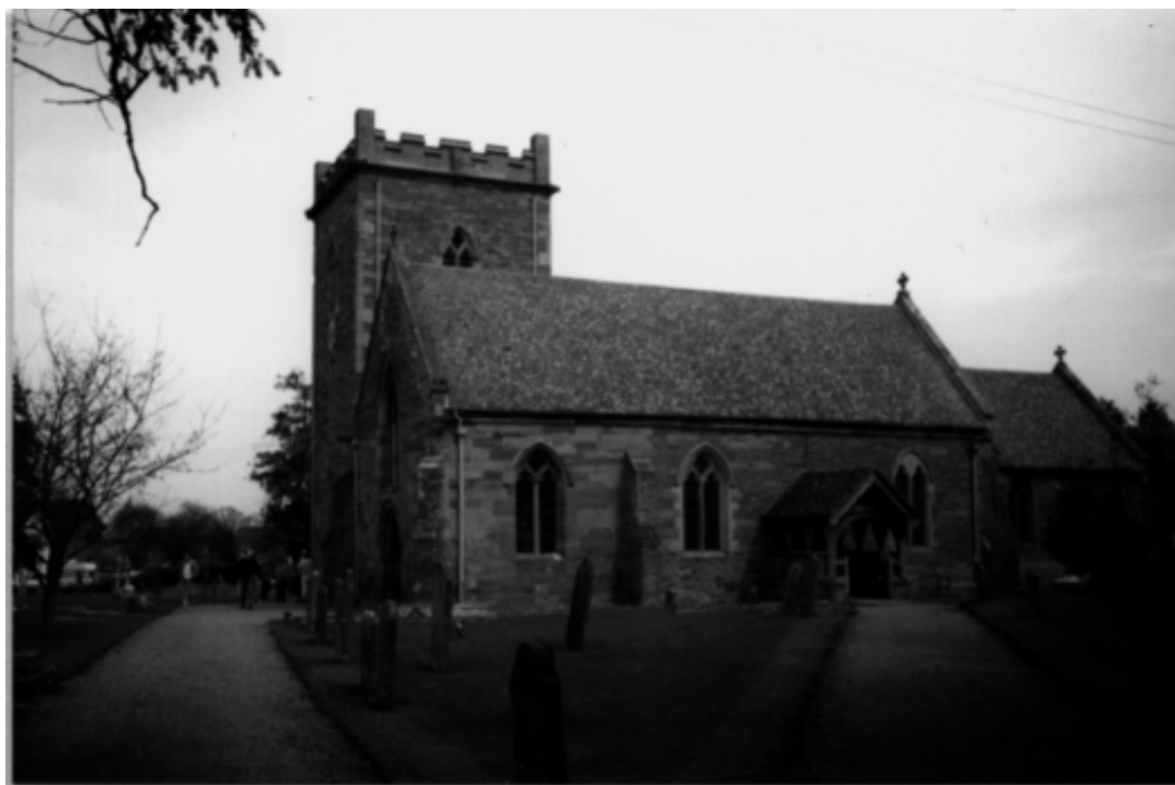
St Michael & All Angels Church, Kingstone, Herefordshire

In its relatively short life span the tower at Llanbradach hosted not only some productive and prosperous times but also some very lean ones as well. During the three main active ringing periods the bells and ringers attained some notable achievements but there were many many years when the bells were hardly heard at all. Whilst it is sad that they will never be heard again in the village, they have certainly been moved to a good home at St Michael and All Angels, Kingstone, Herefordshire, which is only just 'across the border'.