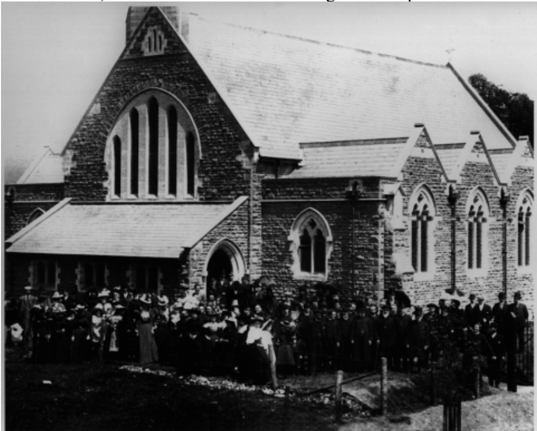
The Opening of the new Church, without the Tower, Chancel or Vestry 1897