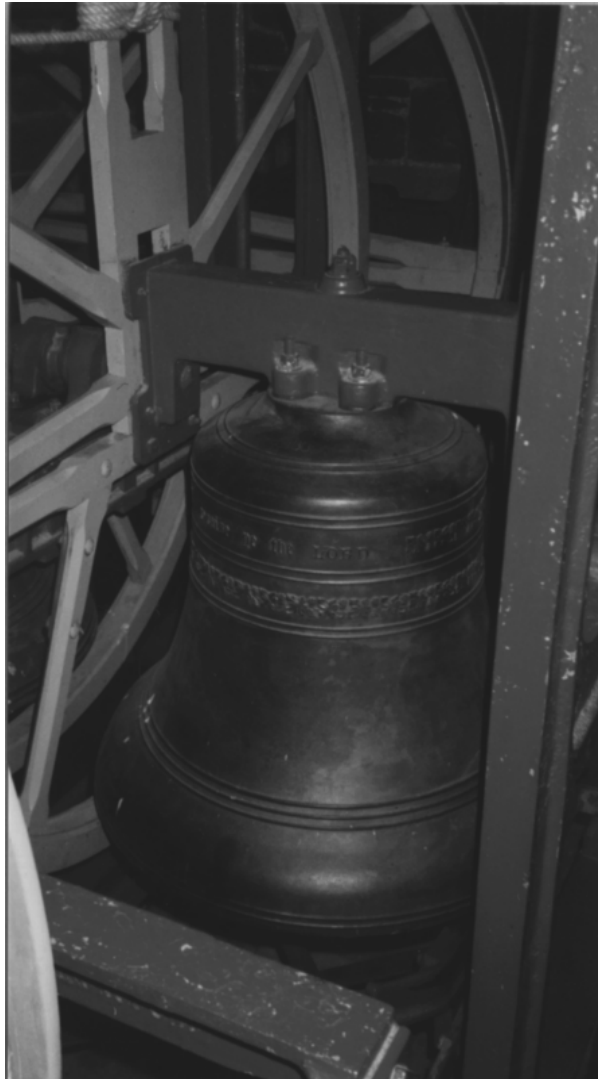
The fifth bell in situ at St Michael & All Angels, Kingstone, Herefordshire