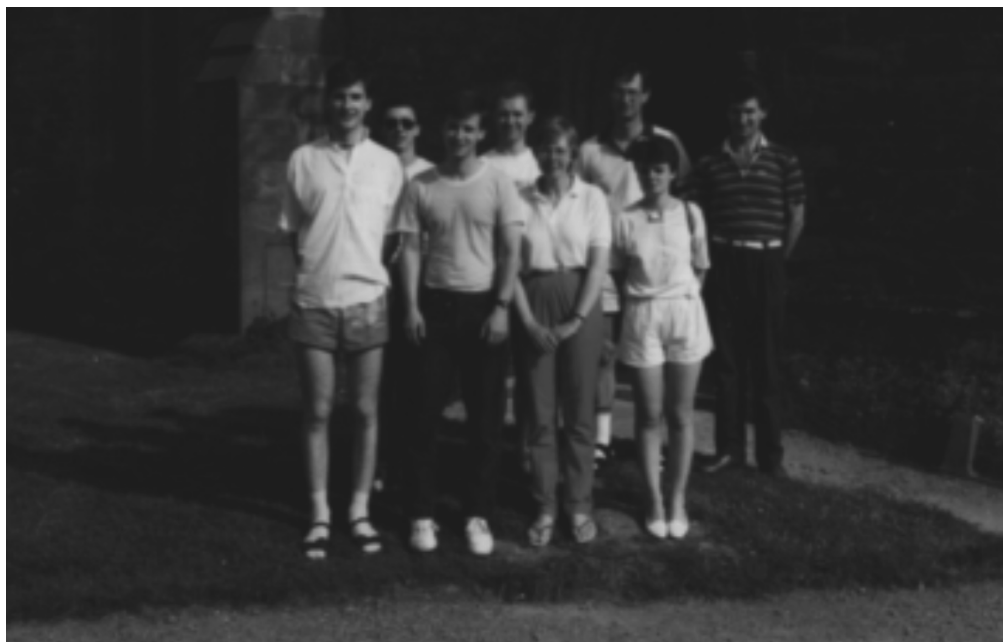
The 1988 Peal Band