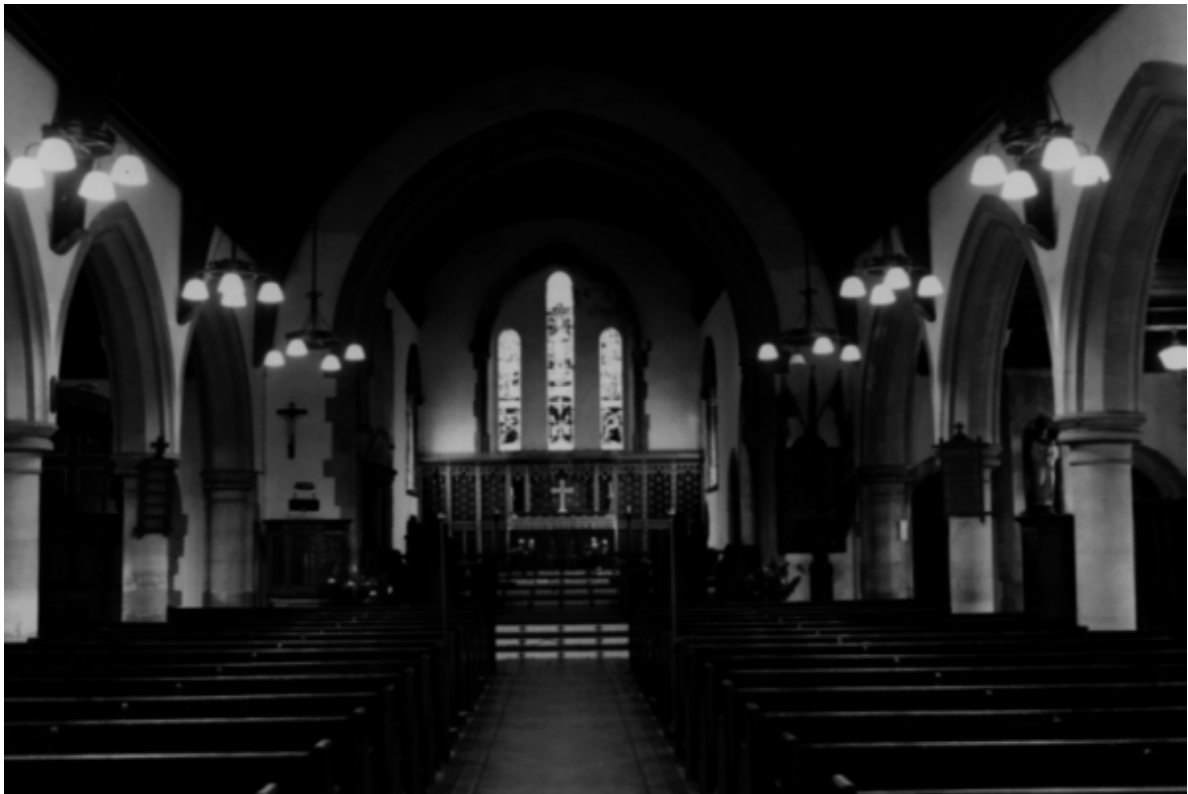
All Saints' Llanbradach - the Nave and Chancel