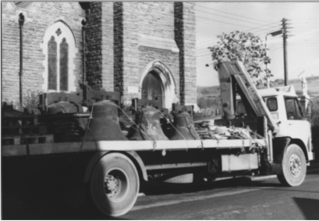
Some of the bells and fittings ready to be transported to Kingstone