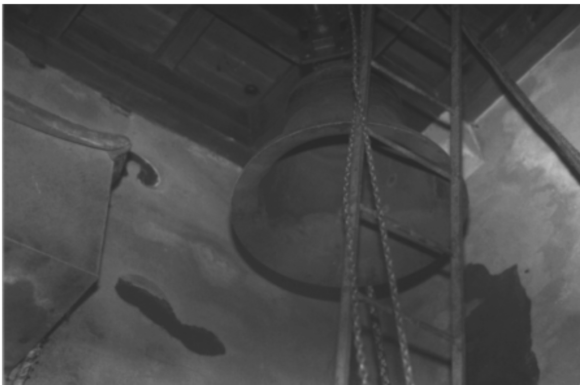
The fifth bell being lowered from Llanbradach Tower