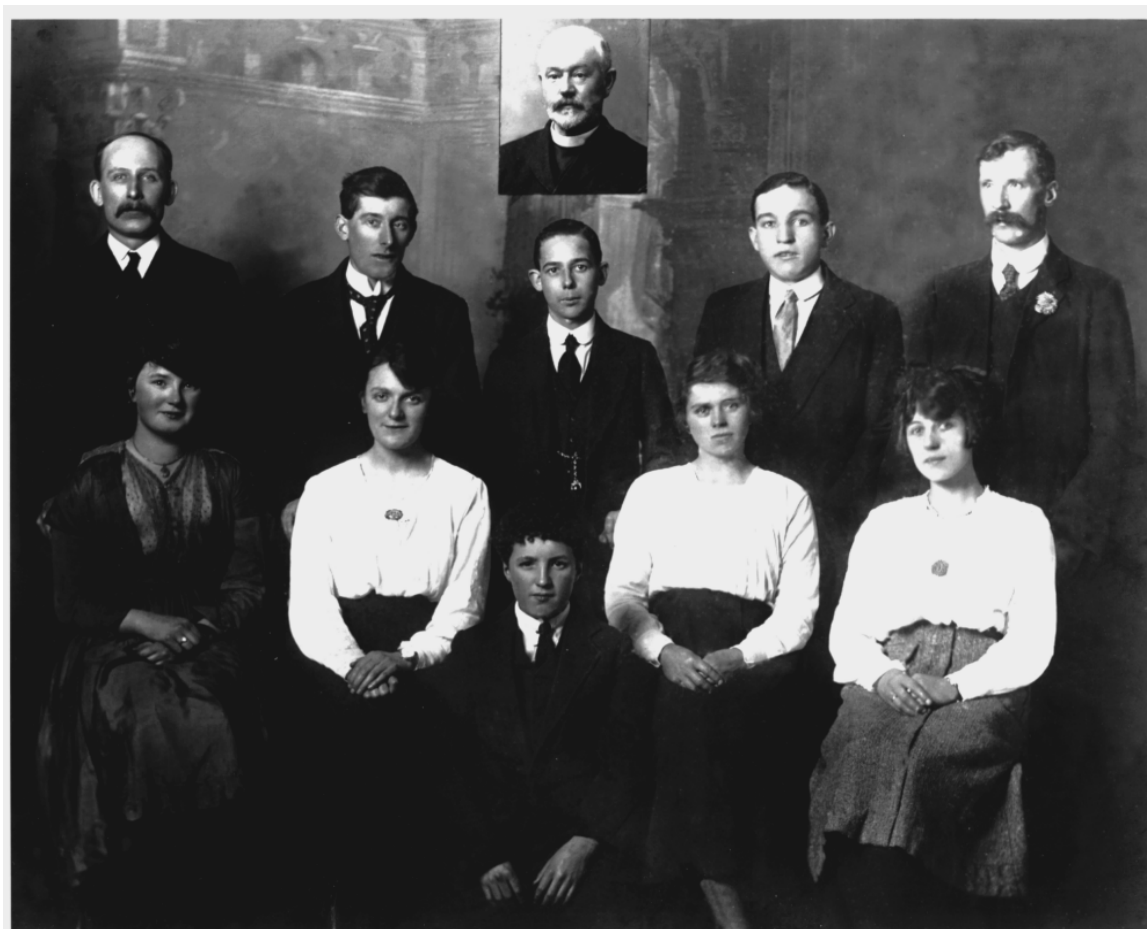
Llanbradach Ringers circa 1917